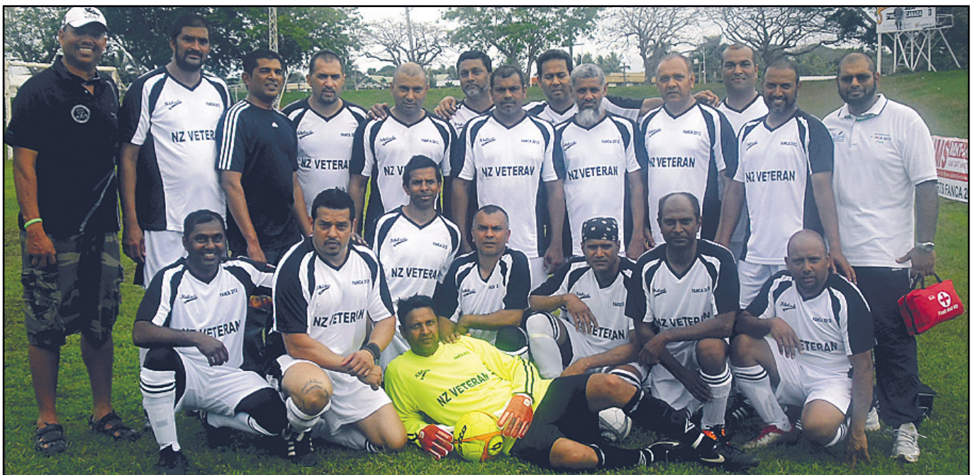
The NZ Veterans over 42's, runners up of FANCA 2012